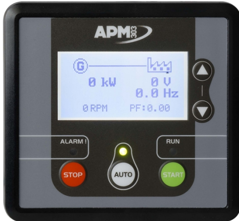
APM303, comprehensive and simple

The APM303 is a versatile unit which can be operated in manual or automatic mode. It offers the following features: Measurements: phase-to-neutral and phase-to-phase voltages, fuel level (In option : active power currents, effective power, power factors, Kw/h energy meter, oil pressure and coolant temperature levels) Supervision: Modbus RTU communication on RS485 Reports: (In option : 2 configurable reports) Safety features: Overspeed, oil pressure, coolant temperatures, minimum and maximum voltage, minimum and maximum frequency (Maximum active power P<66kVA) Traceability: Stack of 12 stored events For further information, please refer to the data sheet for the APM303.