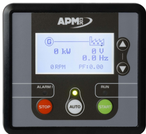
APM303, comprehensive and simple

The APM303 is a versatile unit which can be operated in manual or automatic mode. It offers the following features: Measurements: phase-to-neutral and phase-to-phase voltages, fuel level (In option : active power currents, effective power, power factors, Kw/h energy meter, oil pressure and coolant temperature levels) Supervision: Modbus RTU communication on RS485 Reports: (In option : 2 configurable reports) Safety features: Overspeed, oil pressure, coolant temperatures, minimum and maximum voltage, minimum and maximum frequency (Maximum active power P<66kVA) Traceability: Stack of 12 stored events For further information, please refer to the data sheet for the APM303.