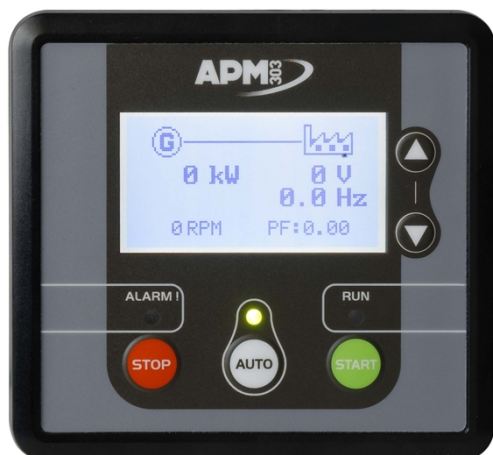
APM303, comprehensive and simple

The APM303 is a versatile unit which can be operated in manual or automatic mode. It offers the following features: Measurements: phase-to-neutral and phase-to-phase voltages, fuel level (In option : active power currents, effective power, power factors, Kw/h energy meter, oil pressure and coolant temperature levels) Supervision: Modbus RTU communication on RS485 Reports: (In option : 2 configurable reports) Safety features: Overspeed, oil pressure, coolant temperatures, minimum and maximum voltage, minimum and maximum frequency (Maximum active power P<66kVA) Traceability: Stack of 12 stored events For further information, please refer to the data sheet for the APM303.