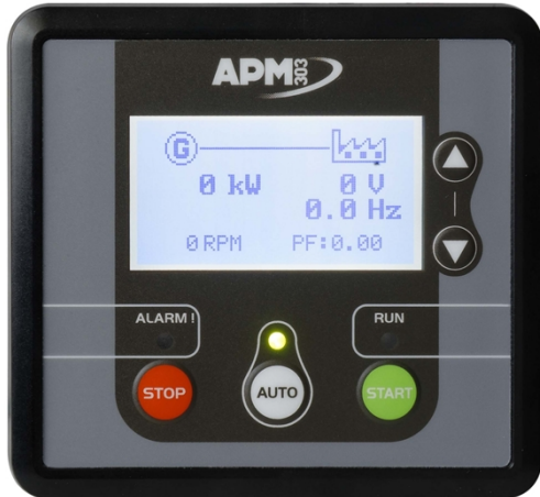
APM303, comprehensive and simple

The APM303 is a versatile unit which can be operated in manual or automatic mode. It offers the following features: Measurements: phase-to-neutral and phase-to-phase voltages, fuel level (In option : active power currents, effective power, power factors, Kw/h energy meter, oil pressure and coolant temperature levels) Supervision: Modbus RTU communication on RS485 Reports: (In option : 2 configurable reports) Safety features: Overspeed, oil pressure, coolant temperatures, minimum and maximum voltage, minimum and maximum frequency (Maximum active power P<66kVA) Traceability: Stack of 12 stored events For further information, please refer to the data sheet for the APM303.