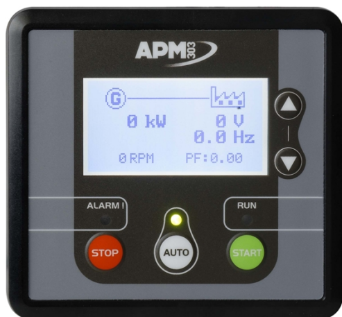
APM303, comprehensive and simple

The APM303 is a versatile unit which can be operated in manual or automatic mode. It offers the following features: